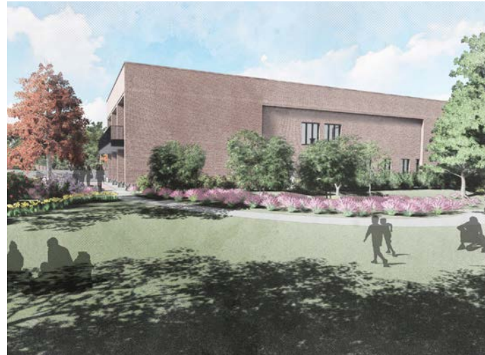
Event lawn outside the future Oakland Cemetery Visitor Center.

In addition to a beautiful new building, our Visitor Center complex will feature outdoor plazas and gardens that will invite visitors to linger, enjoy a picnic, or rest a while before exploring Oakland.