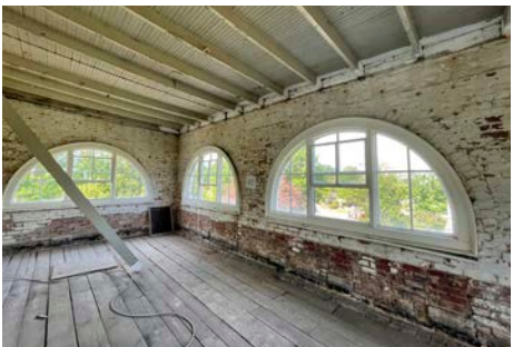
The Bell Tower porch, during construction.