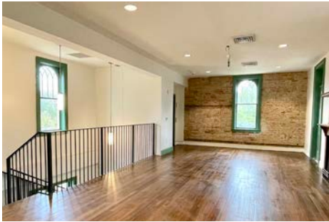
The Bell Tower's upper level after completion.