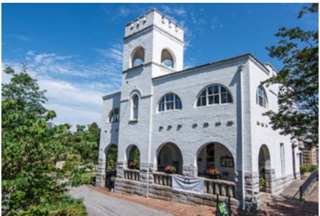
The Bell Tower from the southeast, before.