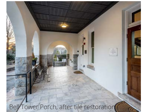
Bell Tower Porch, after tile restoration.