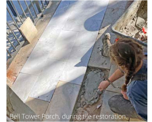
Bell Tower Porch, during tile restoration.