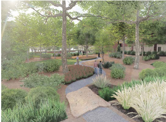
Shaded paths outside the future Visitor Center will feature native plants.

Exterior spaces to focus on sustainability