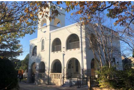
The Bell Tower from the southeast, after.