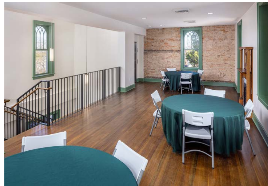
The second floor features an exposed brick wall and access to two covered porches.