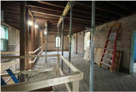
The Bell Tower's upper level during construction.