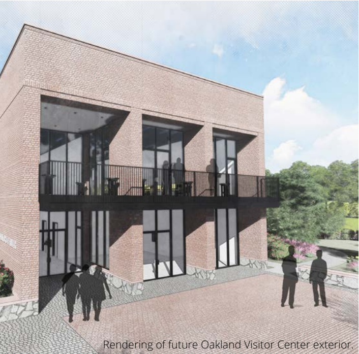
Rendering of future Oakland Visitor Center exterior.