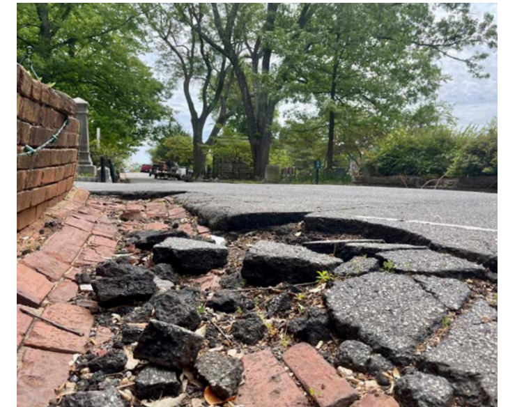
Roadway issues like this will soon be history.

With over $2.4 million from the 2022 Move Atlanta Forward infrastructure bond, the city will repave nearly two miles of roads at Oakland, replace failing water lines, and repair the historic gutters. This major accessibility improvement would not be possible without the support of our partners in the Department of Parks and Recreation and the City Council, in recognition of the Cemetery's importance as a vibrant place for visitors and neighbors alike.