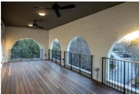
The Bell Tower porch, after construction.