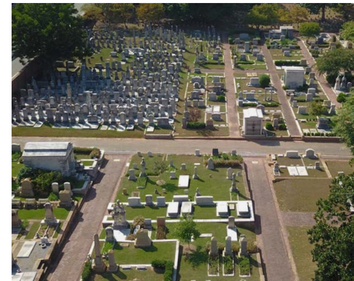
Oakland Cemetery's Jewish Flat and Jewish Hill.

In 2023, the Foundation will launch a publicly accessible interactive Geographic Information System (GIS) map and searchable database. When you visit Oakland you'll be able to scan a QR code that will pull up an interactive map of the Cemetery and geolocate your position. This map will help you find specific burial sites at Oakland, amenities like restrooms, or the Oakland Bell Tower. It will also provide you with additional information about the Cemetery and its residents.