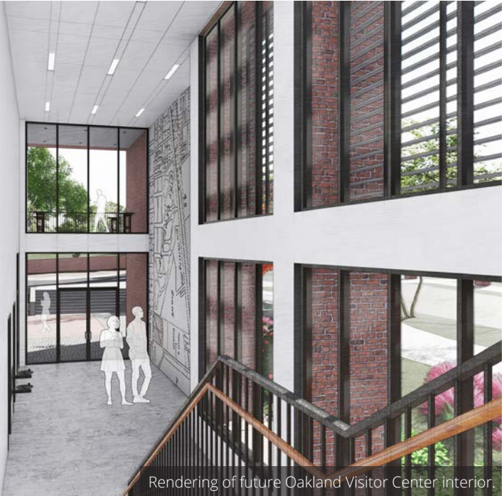
Rendering of future Oakland Visitor Center interior.