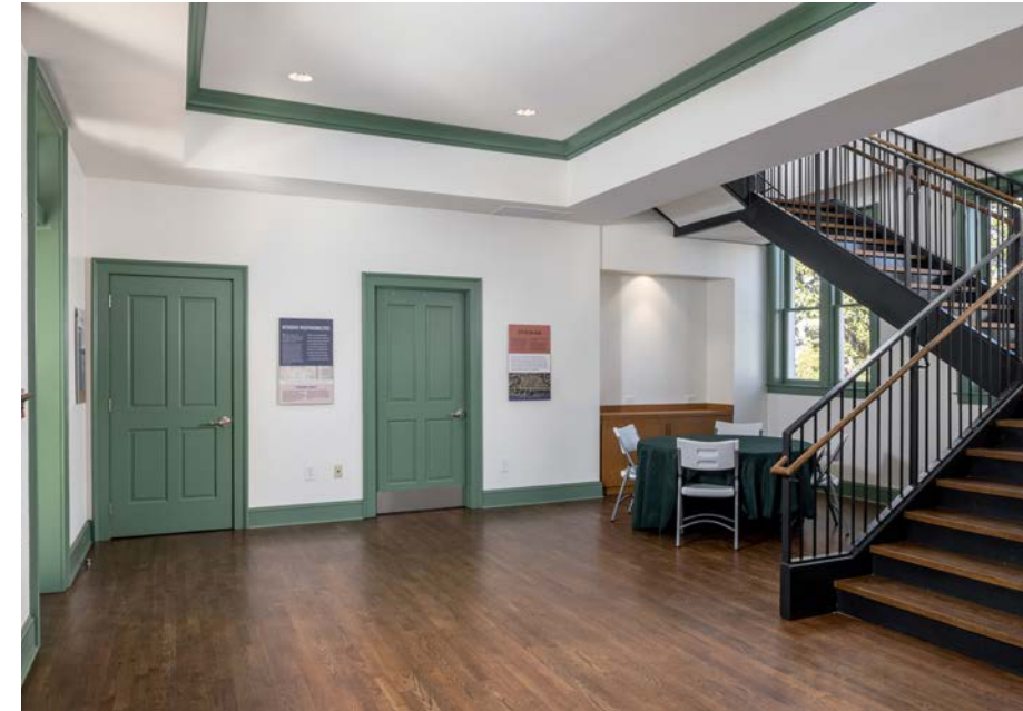
The Bell Tower's first floor features a public restroom and panels about the building's history.

The public can access the first floor of the Bell Tower, where they'll find an accessible restroom as well as interpretive panels describing the history of the building and of Oakland. Oakland Cemetery Sexton Sam Reed has relocated his office to the Bell Tower. The second floor of the building, with two porches offering sweeping views of the cemetery and of the Atlanta skyline, is available for private event rentals and meetings.